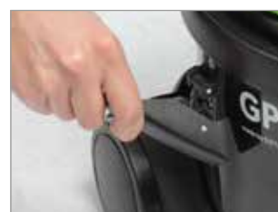
EXTREMELY FLEXIBLE HOOKS