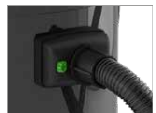
FLEXIBLE HOSE IS LOCKED SECURELY AND RELIABLY