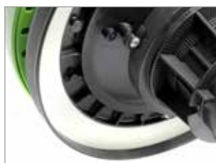
INNOVATIVE HEAD GASKET