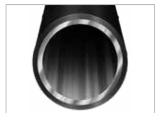
AP TUBES ARE LIGHTWEIGHT AND EXTREMELY ROBUST