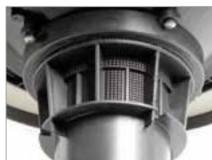
INTEGRATED ANTI-FOAM SYSTEM