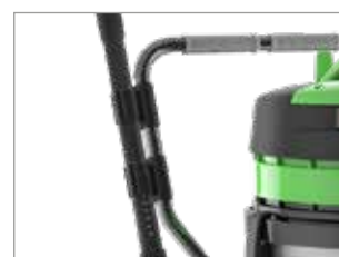
TROLLEY WITH HANDLE AND CLIPS FOR PARKING POSITION