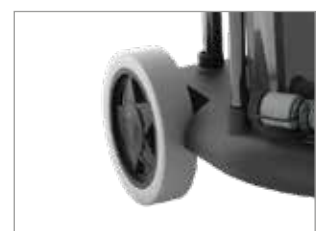
LARGE REAR WHEELS WITH TYRES