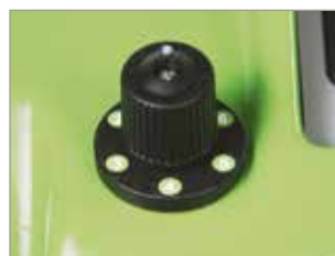
ROTARY KNOB FOR STEAM FLOW RATE CONTROLLER