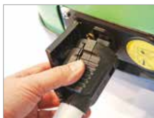
STEAM HOSE HOOK EQUIPPED WITH SAFETY PANEL