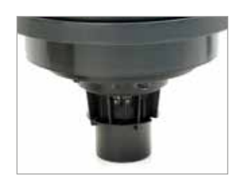
INTEGRATED ANTI-FOAM SYSTEM