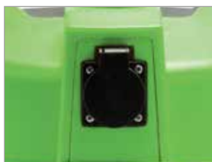
SOCKET FOR POWER TOOL WITH AUTOMATIC START/STOP (TC)